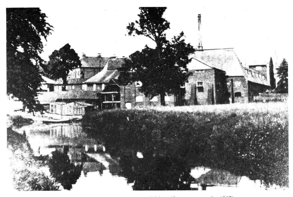
The river access to Stead's Quay Maltings (from a postcard \epsilon . 1907).