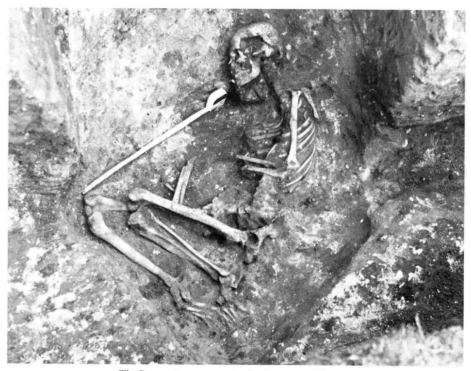
The Bronze Age graves at Exning (tape set at 50cm).